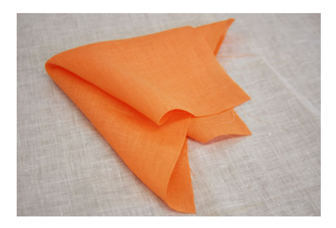
Cut that linen and we are all ready to get started sewing!