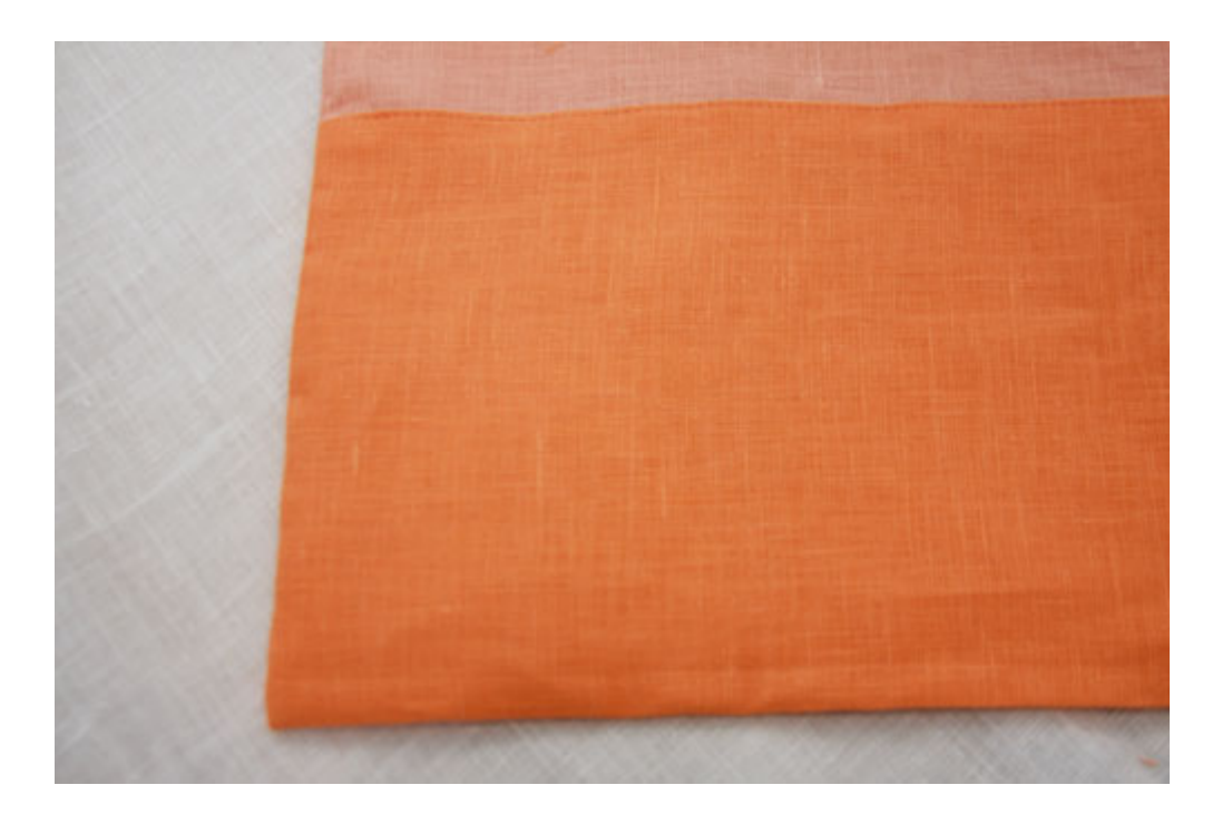
Flip your bag inside out so the clean seam is revealed!