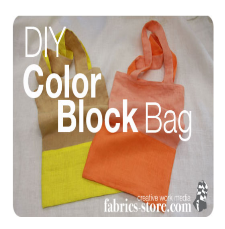
A Trend-worthy Color Block Bag